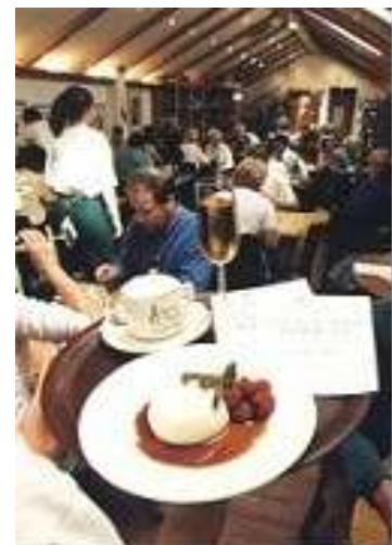
The Caffè Bar in Full Swing

*If you book at the Caffè Bar you will receive 10% discount on any products you wish to purchase from the Shop on the evening.